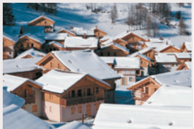
Pragelato is a four-season alpine resort

WHILE watching the winter Olympics a few weeks ago, you probably never dreamed that you could buy a chalet just a few meters away from one of the competition areas.