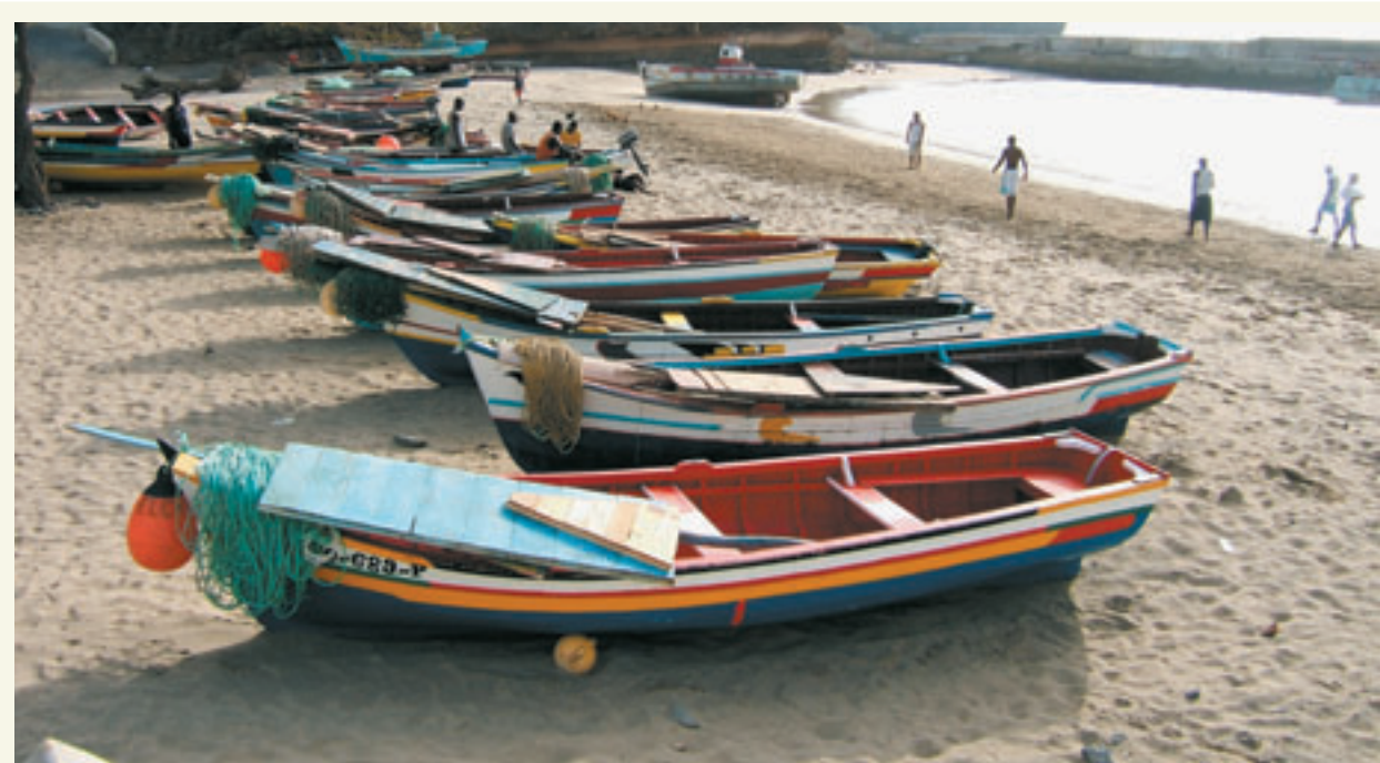
"Santiago is now where the Canaries were 30 years ago but with the bad bits taken out"