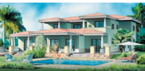
There are 36 detached villas with private pools

LOCATED on the Island of Sal, which is Portuguese for salt, the recently launched Murdeira Beach Resort is a new development based just 10 minutes from Sol international airport. TV presenter Eddie Hobbs has been supporting its market-