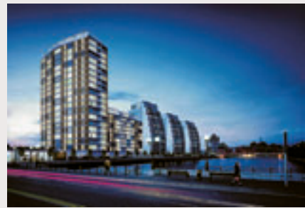
Salford Quays in Manchester comprises two linked residential towers

Details from Ely Properties (01-703 8900).